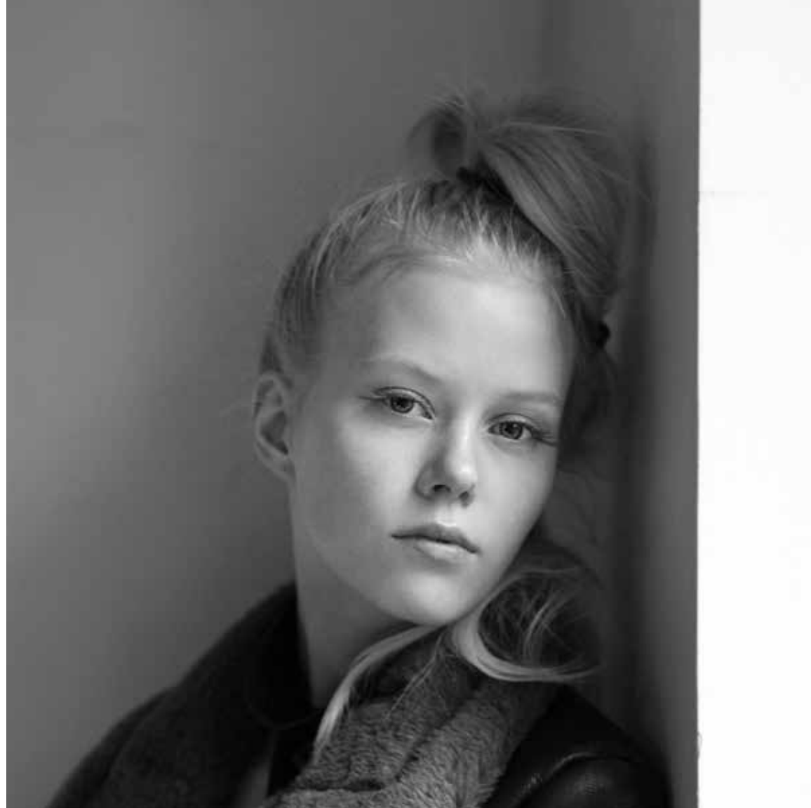
JACKET PIXIE MARKET